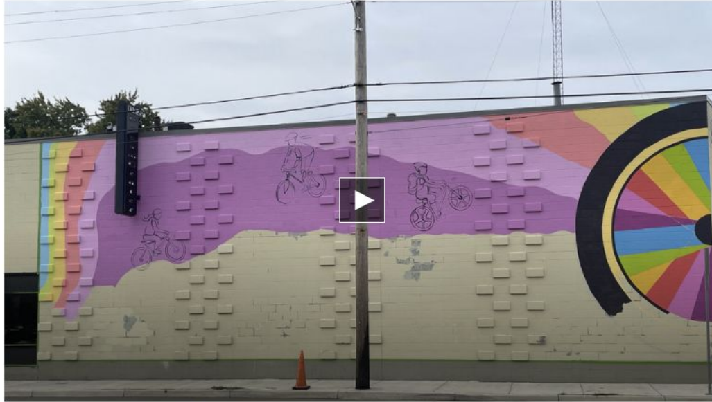
Bike Friendly Kalamazoo showed off a new mural in the Edison neighborhood. The mural is to show the joys of bicycling. Sept. 19, 2023.